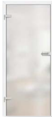
GRAF 8 DECORMAT