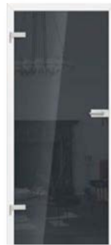
GRAF 26 DARK GREY