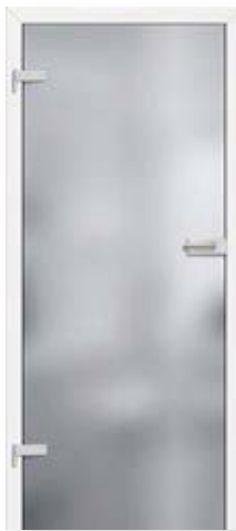
GRAF 11 DECORMAT GRAPHITE